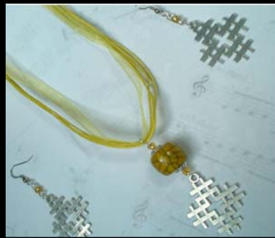
tres sharp "got rhythm"

Notables pendants are diecast pewter & measure 1.25". Made in USA. Lead free.