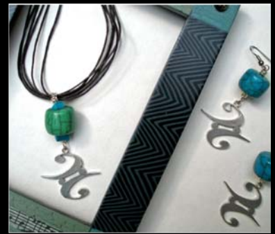
harmony "the blues"

More styles available using the original harmony design