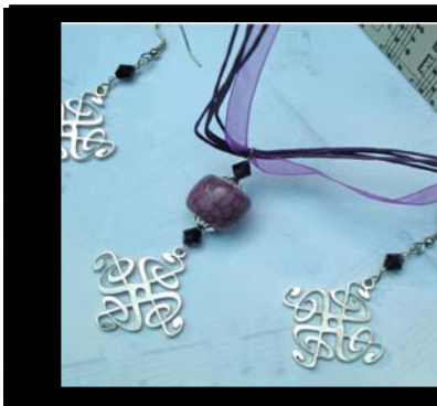
encore "deep purple"

AFFORDABLE ART... keeping the arts alive